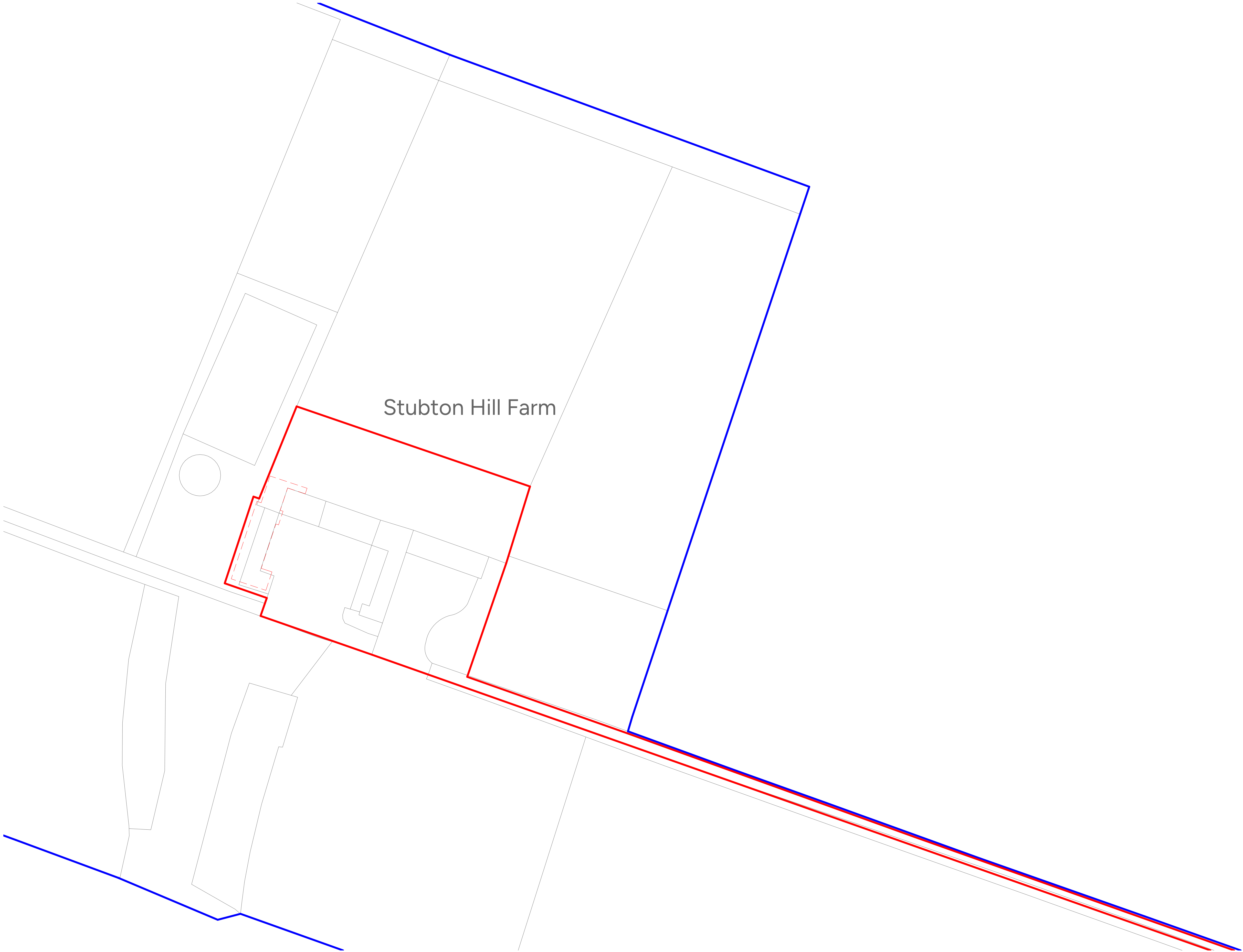
Block Plan 1 : 500