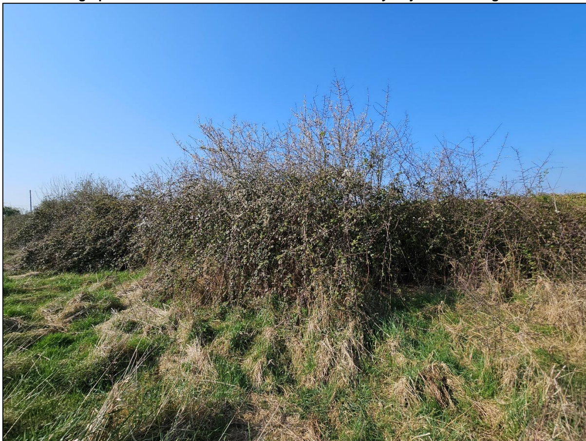
Photograph 4: Trees T1 and T2 in Hedgerow H2 with Mixed Scrub SCR3 and Bramble Scrub SCR1