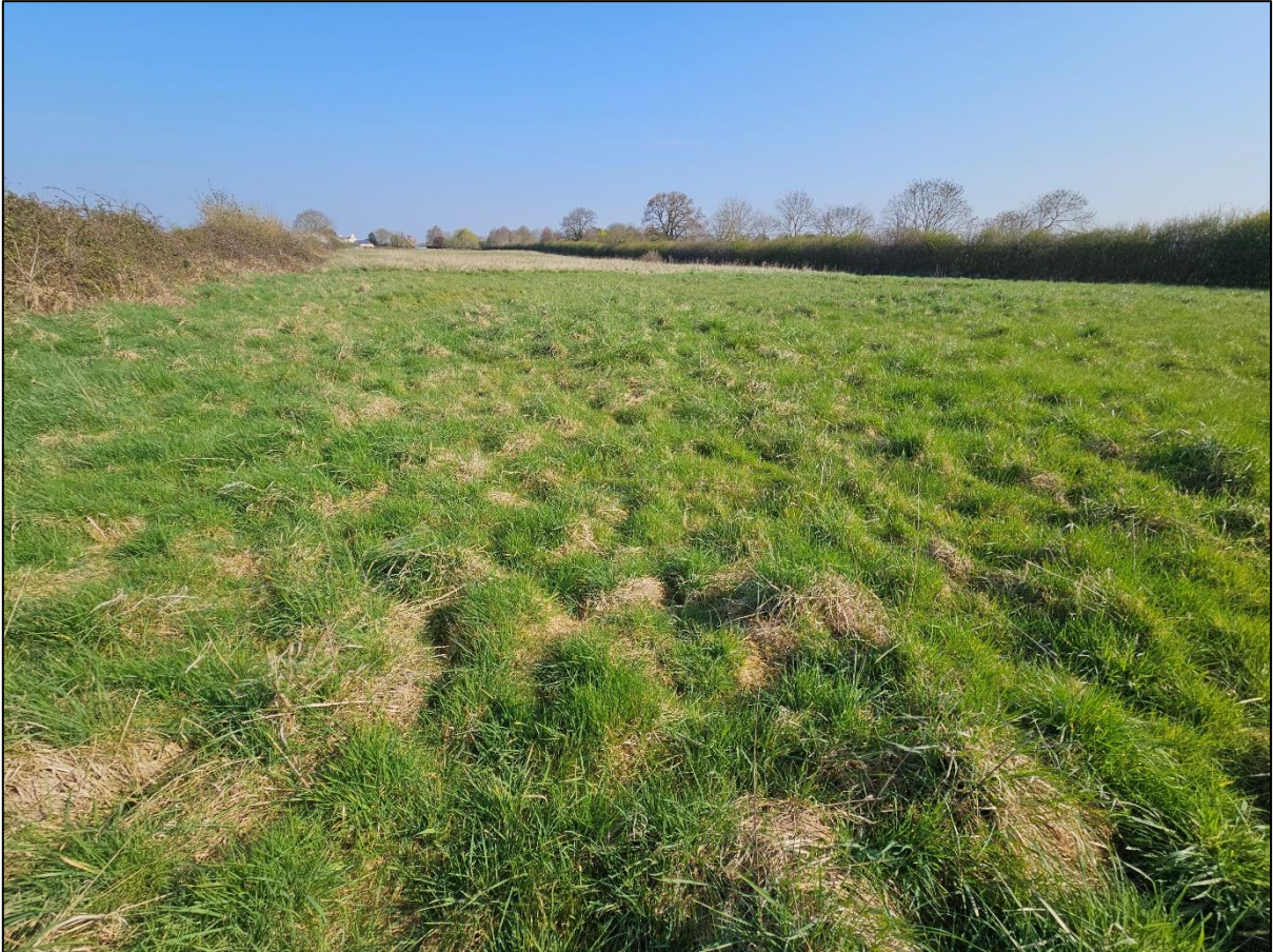
Photograph 2: Overview of Modified Grassland Parcel G2